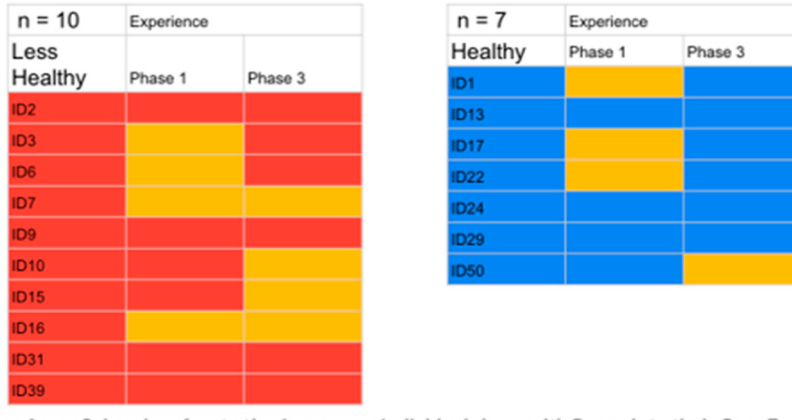
Figure 4. The Avoidance Scale EPS: Less Healthy vs. Healthy Coping Groups.

The Experience Subscale refers to the Awareness Individuals have with Regards to their Own Emotions